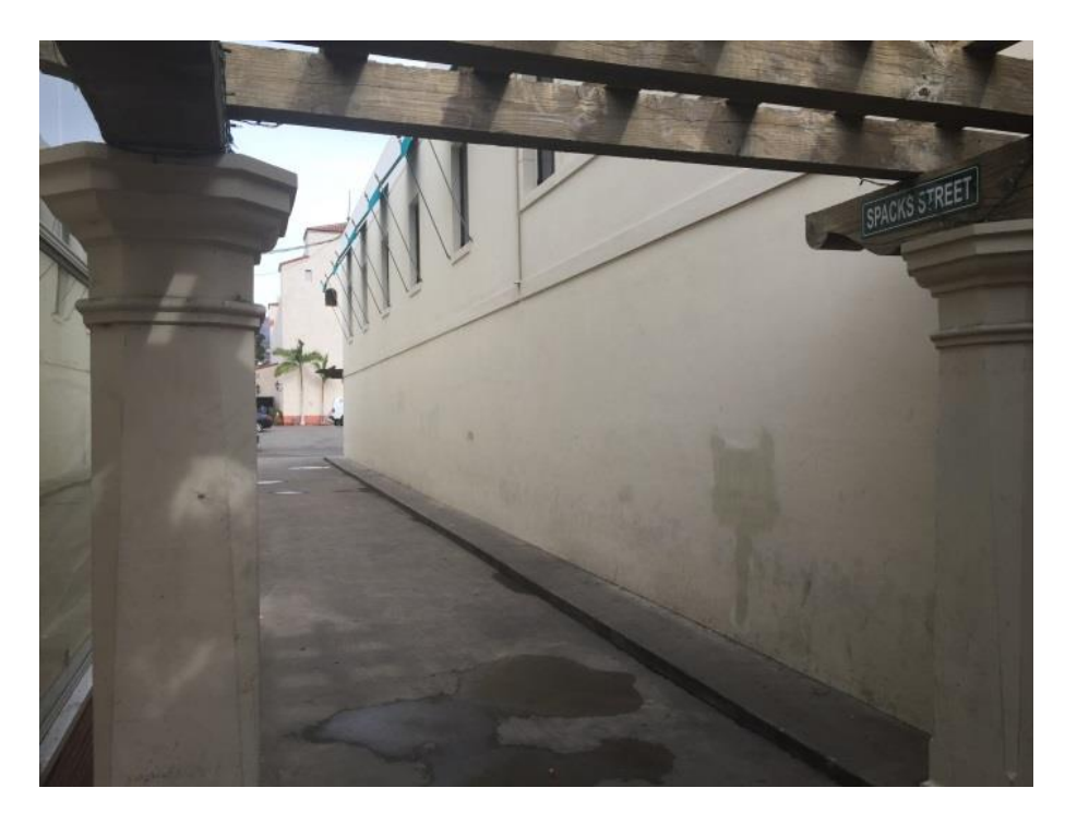
Image #2 - from the outside parking area behind the Granada Garage looking west towards State Street with the North facing wall of 1214 State Street visible

Image #1 - from State Street looking east towards the Granada garage with the North facing wall of 1214 State Street visible